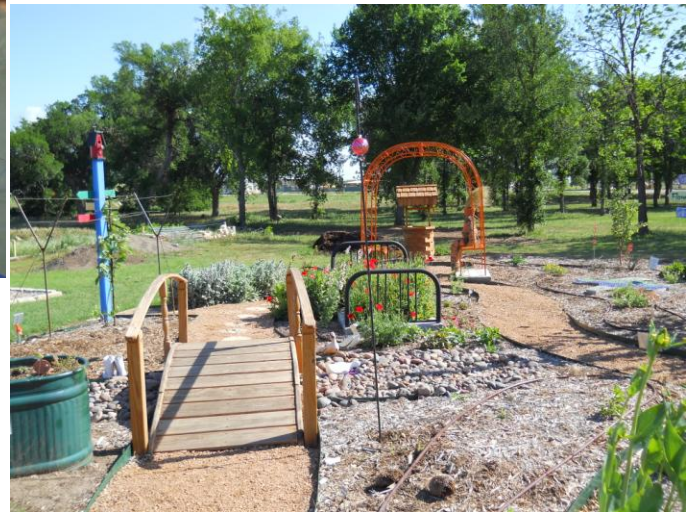
Grandbury MG Demonstration Garden