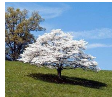
Dogwood Tree in Bloom

I loved the gardens at Monticello. The history of gardening by Thomas Jefferson was so interesting, and the beds, lovely in their own right, are laid out to take advantage of the beautiful views.