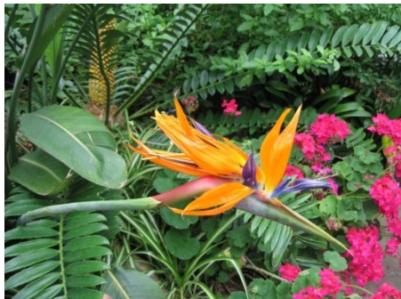
Kat loves tropical flowers like this Bird of Paradise!

I love pansies, roses, plumerias and pecan trees, but alas! For the moment, I am in an apartment without a good yard.